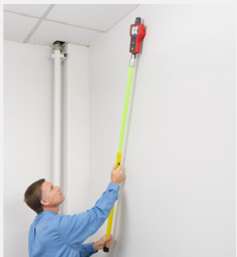
Trace wires in hard to reach places with the TIC 410A.