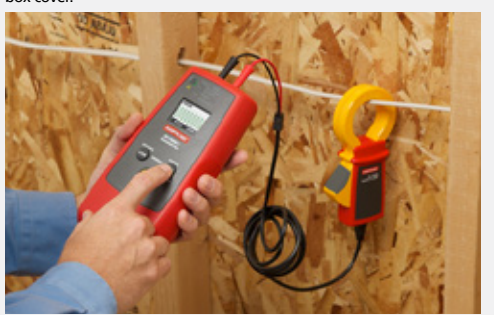
Induce signal with the signal clamp when there is no bare conductor.