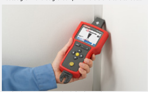
Use the Tip Sensor to trace wires in hard to reach areas