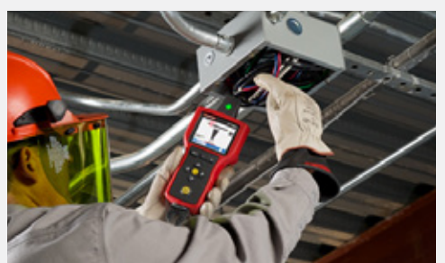
Trace energized or de-energized wires by removing the junction box cover