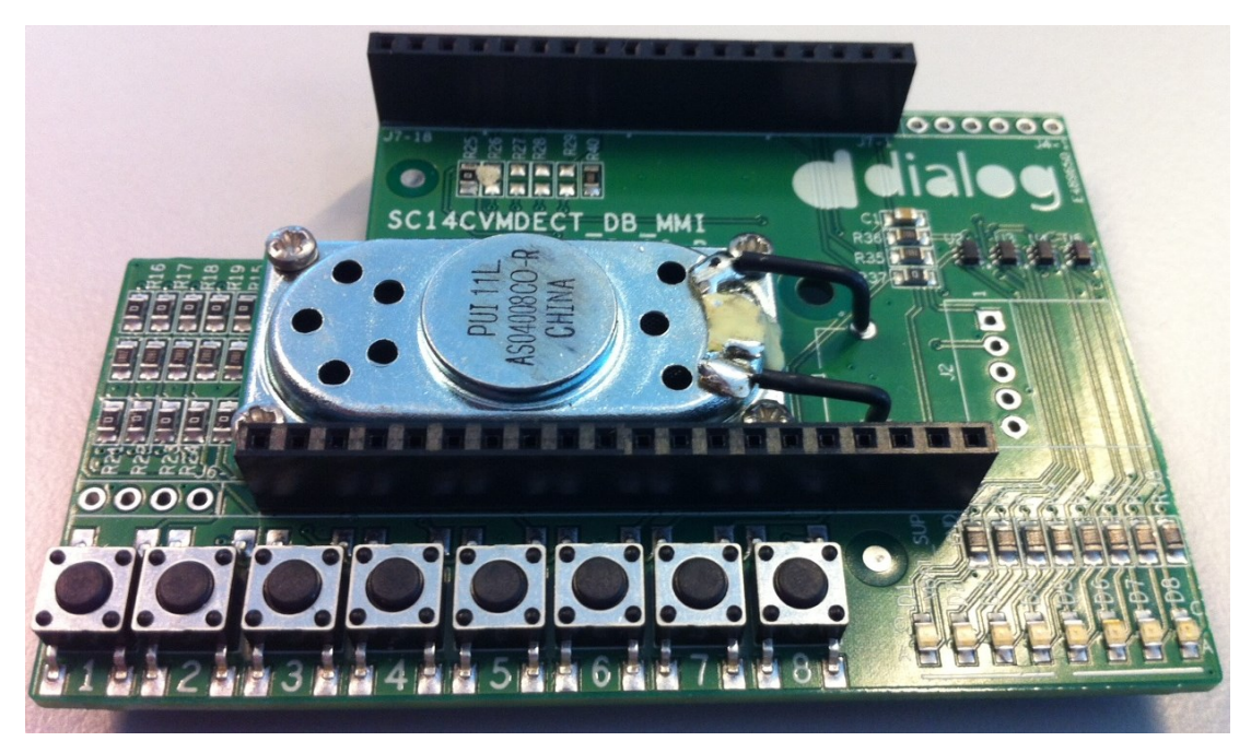
Figure 3 Part of SC14CVMDECT_DB_MMI (lower PCB)