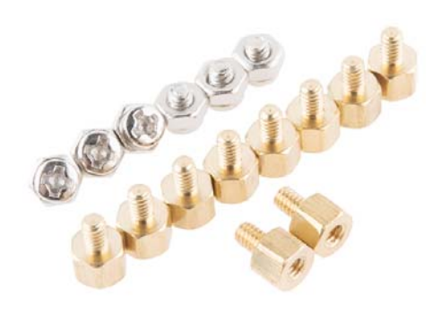
Intel Edison Hardware Pack

The power switch connects power to the stack. When off, the battery is disconnected from the stack but is still capable of charging. You can charge the battery while the switch is on. Can't get much simpler than that!